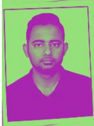
Too much Extra Color X