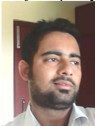
Facing Sideways X