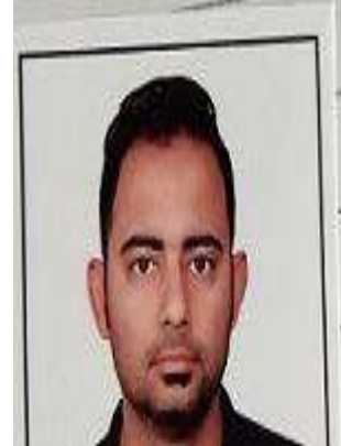
Too Close X