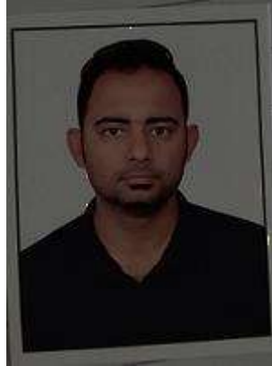
Too Dark X