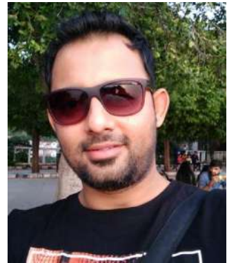
With Goggles X