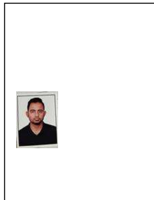
Too Small X