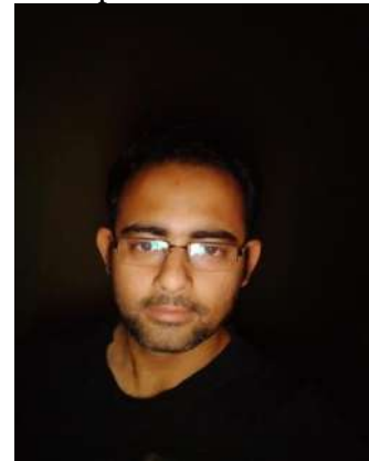
with Spectacles X